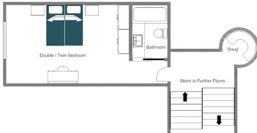
MARIA SCHNEE - UPPER GROUND FLOOR, FOR ILLUSTRATION PURPOSES ONLY