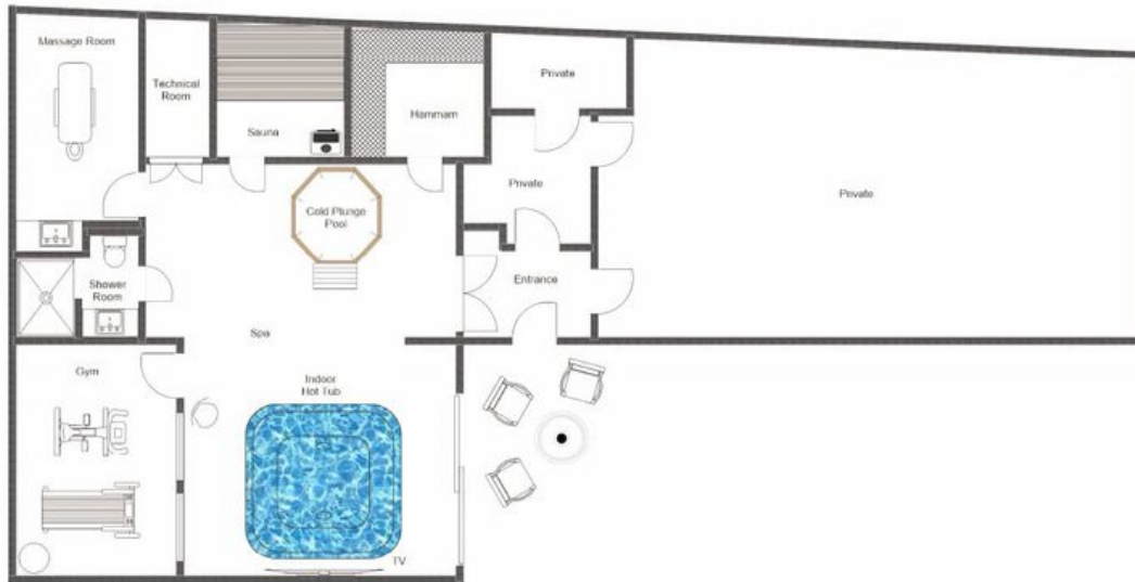
SASHA - APARTMENT 4, SPA ANNEXE FOR ILLUSTRATION PURPOSES ONLY